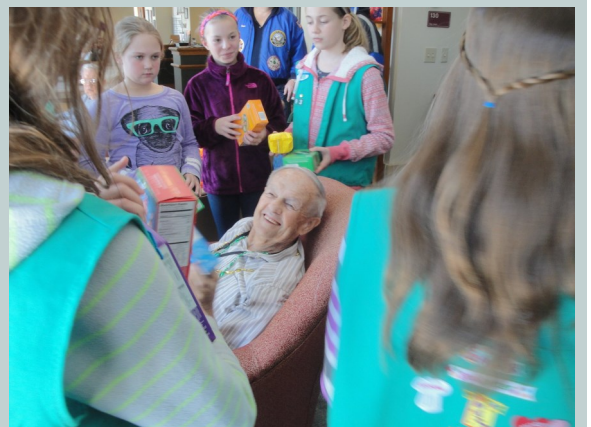
Pictured above are the Girl Scouts of Troop 7293 bringing cookies and smiles to the residents of the Southern WI Veterans Center in Union Grove, WI.