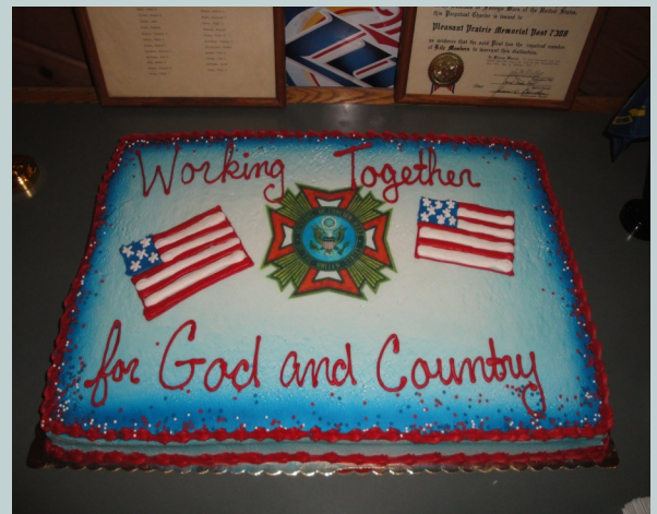
Pictured above is the cake to celebrate the consolidation for the two Posts and displaying the theme of WORKING TOGETHER and in so doing, we them members of the consolidated VFW Post 7308 Pleasant Prairie Memorial Post rededicate ourselves to God and Country!

Those of us who are original members of VFW Post 7308 welcome our new Comrades with open arms and we are very proud to have each and everyone of you among our growing membership. We look forward to a great combined Post that shows we have picked up the challenge of "WORKING TOGETHER!"