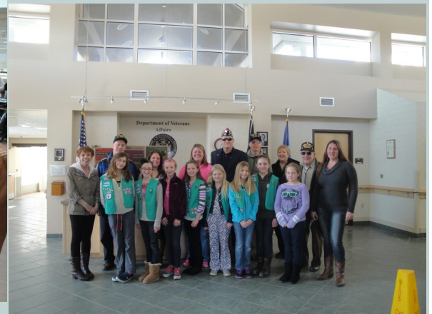
Pictured above are the Girl Scouts of Troop 7293 and members of the different organizations who came along with us to deliver the cookies at the Southern WI Veterans Center in Union Grove, WI

On 08 March 2015, members of VFW Post 7308, Girl Scouts of Troop 7293, members of VFW Post 1865, members of Navy Club Ship 40—Kenosha and St. Mary's Lutheran Church came together to bring laughter, smiles, love and cookies to the Veterans and in some cases their families, at the Southern WI Veterans Center in Union Grove, WI.