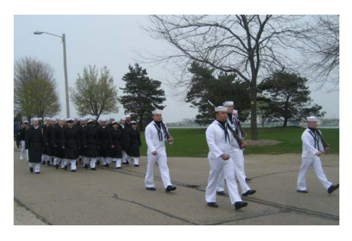
United States Navy Training Service Command Drill Team and Students Marching Unit taking part in the Loyalty Day Parade 2016.