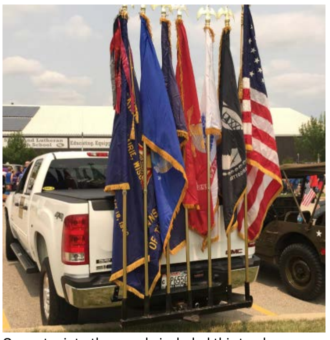
Our entry into the parade included this truck carrying all the Post colors. This has been a tradition of our Post for nearly 20 years and we are always anxious to take part in the Somers Independence Day Parade