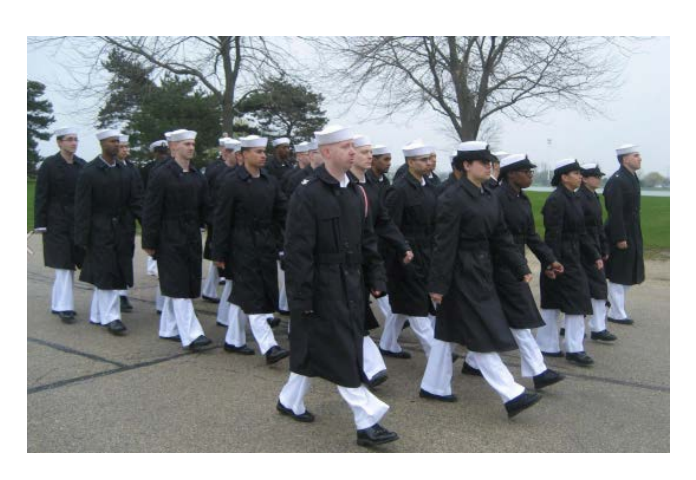
United States Navy Training Service Command Students Marching Unit taking part in the Loyalty Day Parade 2016.