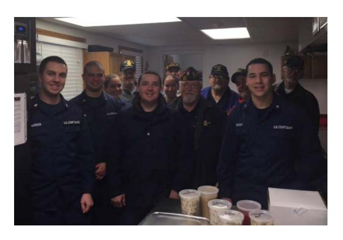
U.S. Coast Guard Duty Section on Easter 2016 and members of VFW Post 7308 brining Easter Brunch for the young men and women of the STANT.

VFW Post 7308 adopted the U.S. Coast Guard Stant - Kenosha, several years ago. Since that time, we have hosted Thanksgiving and Easter Luncheons for them and have had a cook out at the station. These are fine young men and women who are serving, away from home and families, who are deserving of much more. We spend a little time with them, thank them for their service and tell a few sea stories among mariners. We thank them for their sacrifices and praise them for their devotion to duty.