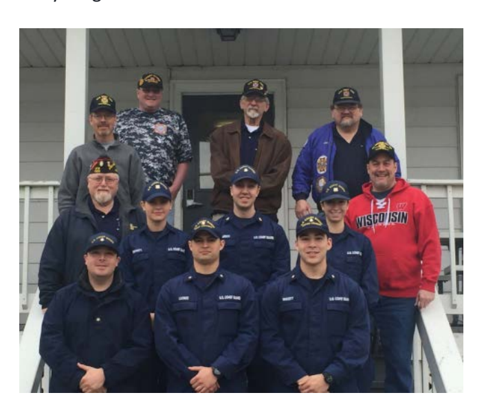
On the steps of the STANT - Kenosha, U.S. Coast Guard and VFW Post 7308.