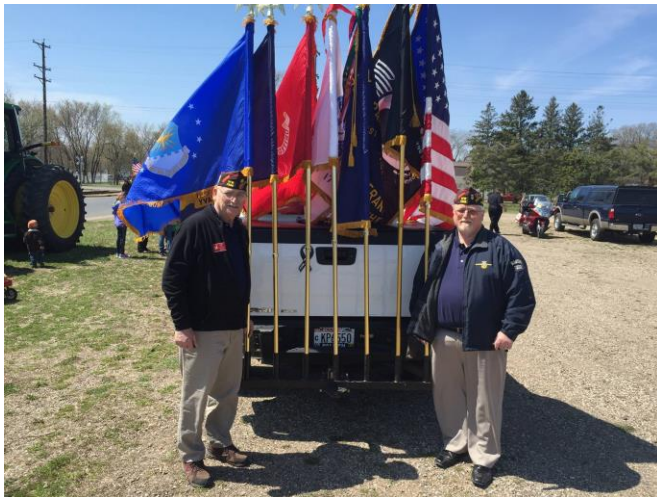
This years parade was hosted by VFW Post 10118 New Richmond Memorial Post. They did a wonderful job and there were 87 units in the parade. The people of New Richmond turned out and were very welcoming and patriotic as the parade went down the main street of the city.